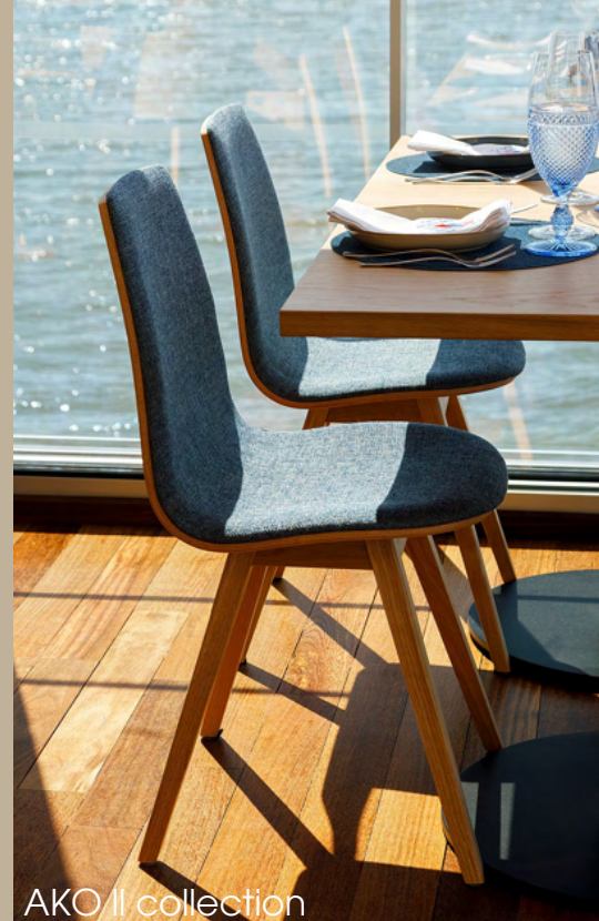
AKO II collection

This achievement reinforces our customers trust in our products. Together, we will continue to innovate and deliver solutions that combine design, functionality and sustainability.